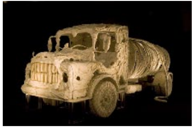
Jitish Kallat: Aquasaurus , 2008

The portraits in the series Universal Recipient are equally laden with irony. We are presented with the uniformed staff of different private security firms posing in front of a striped background. The title of the series