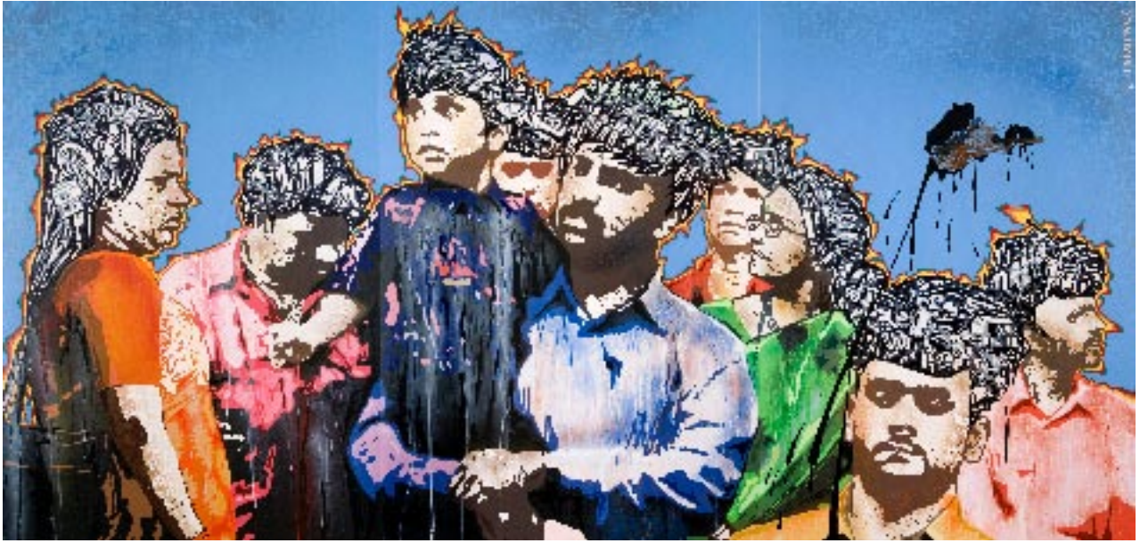
Jitish Kallat: Sweatopia-2 , 2008