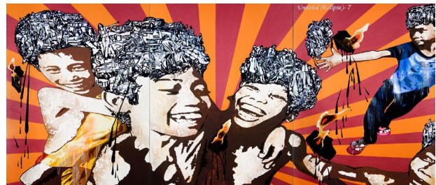
Jitish Kallat: Untitled (Eclipse-7) , 2006

is displayed like a logo in the top right-hand corner of the picture. It is a sarcastic advertisement Kallat has created here – it is, as he himself has said, a kind of double image that implicitly portrays the lives of those who are paid to defend the wealth of others while living in slums and poverty themselves. The two bronze owls on which the canvas rests are references to the commemorative plaques at the Chhatrapati Shivaji Terminus station in Mumbai: Here Kallat has given the employees of private security firms their very own memorial.